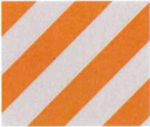
8 - Directional Caution Wayfinding Sign