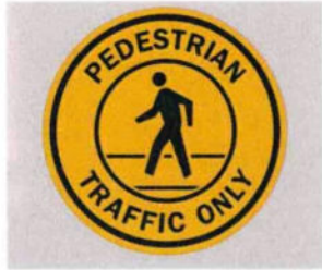
8 - Pedestrian Traffic Wayfinding Sign