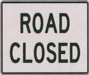
8 - Road Closed Wayfinding Sign