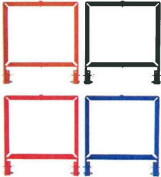
8 - Wayfinding Frame