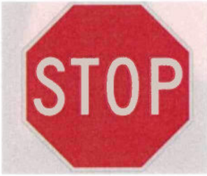
8 - Stop Wayfinding Sign