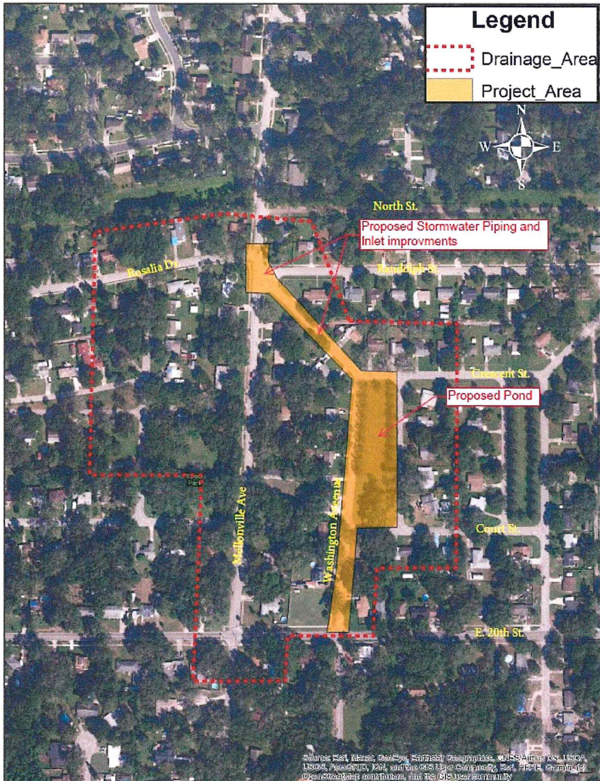
Figure 1: Location Map – Washington Pond and Stormwater Improvements